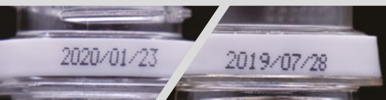
Print Speed 140m/min